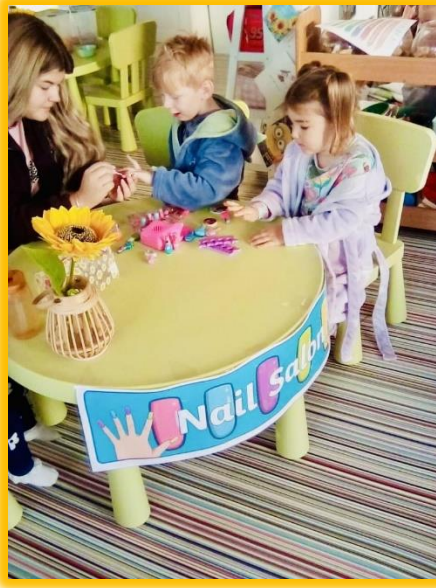
Little Beans Weymouth – September 2024