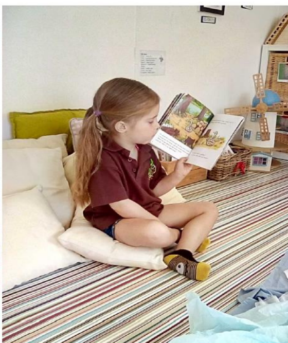
Little Beans Weymouth