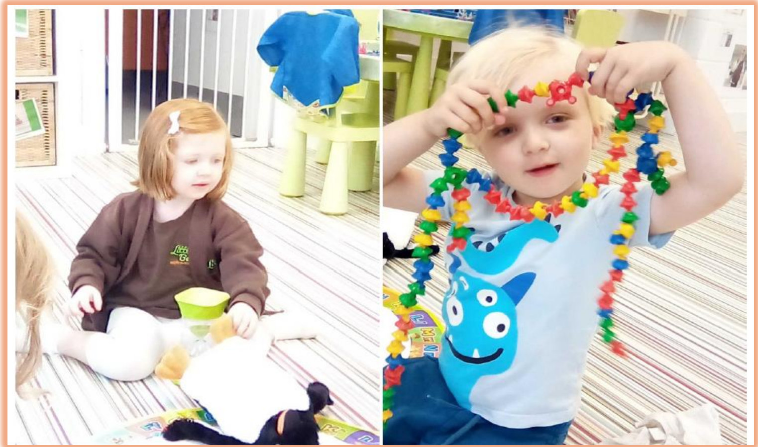
Little Beans Weymouth