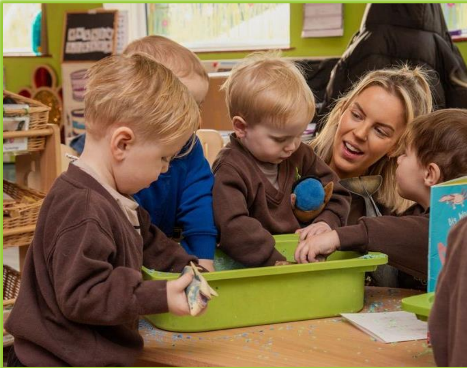
Little Beans Garland – 2024