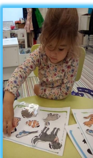
Little Beans Weymouth