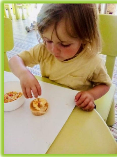
Little Beans Weymouth