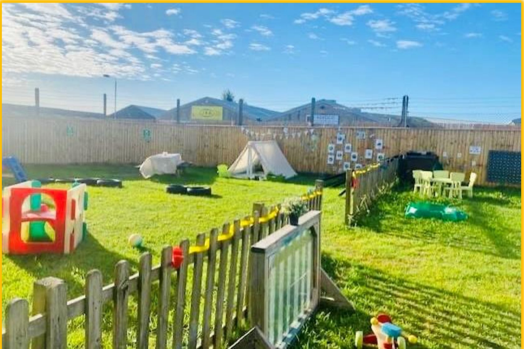
Little Beans Weymouth