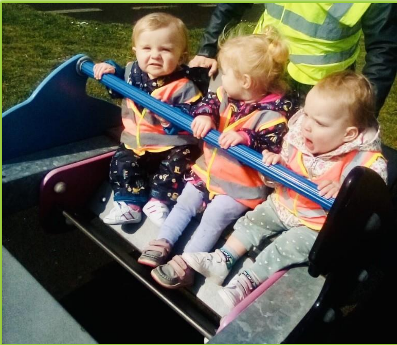
Little Beans Garland – May 2024