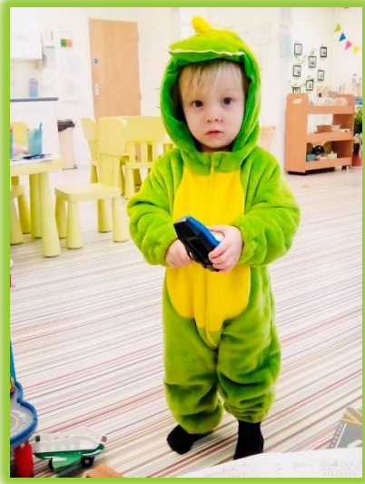
Little Beans Weymouth – March 2024