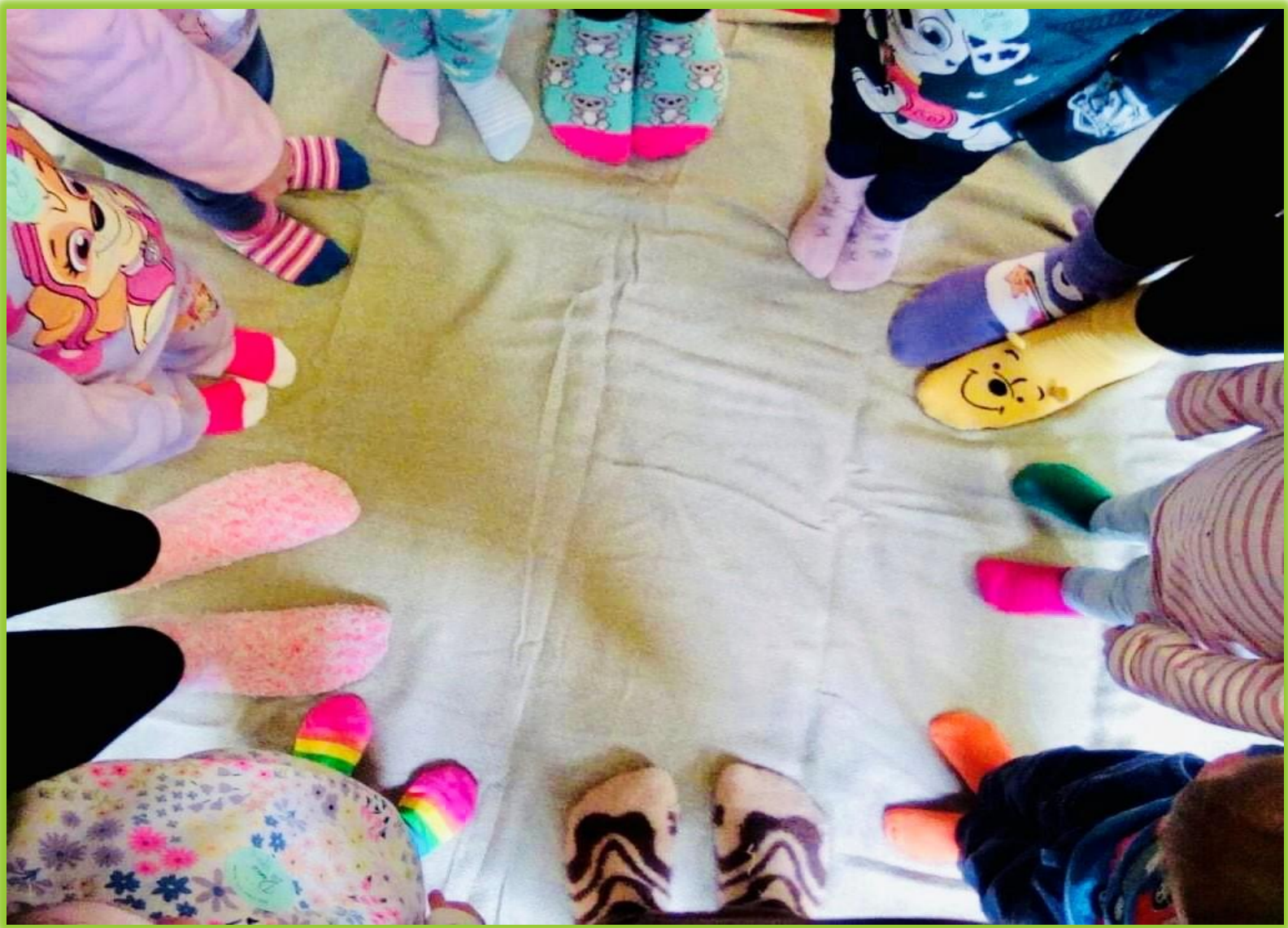
Little Beans Garland – March 2024 – World Down's Syndrome Day