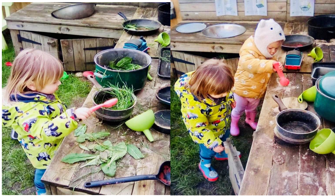
Little Beans Weymouth – January 2024