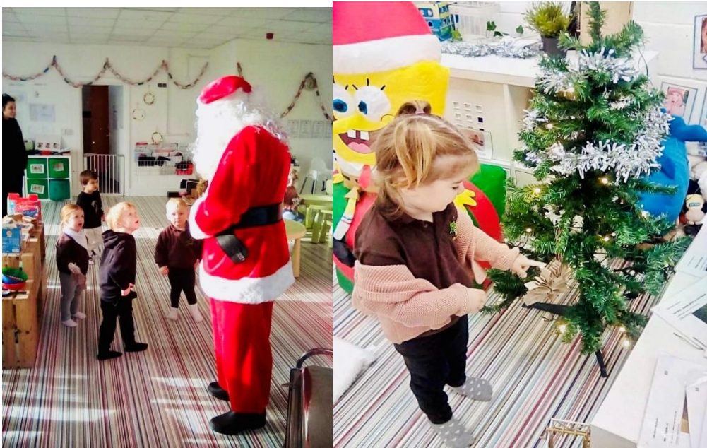
Little Beans Weymouth – December 2023