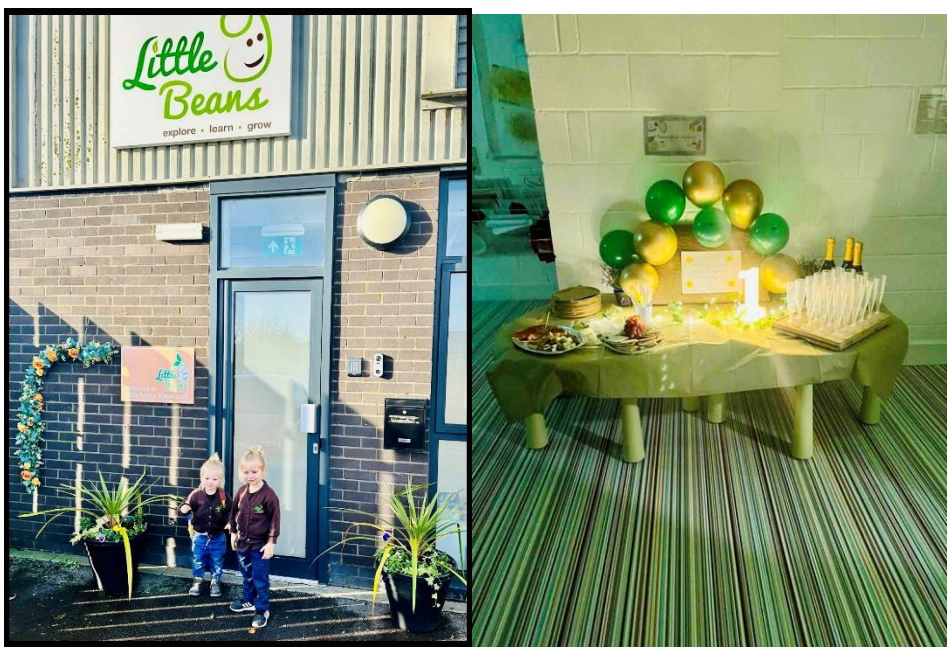
Little Beans Weymouth – November 2023