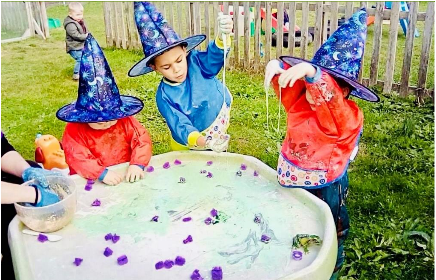
Little Beans Weymouth – November 2023

We look forward to seeing our all year-round children W/C Tuesday 2 nd January 2024, and our term time only children the W/C 8 th January 2024. We wish you all a wonderful festive season!