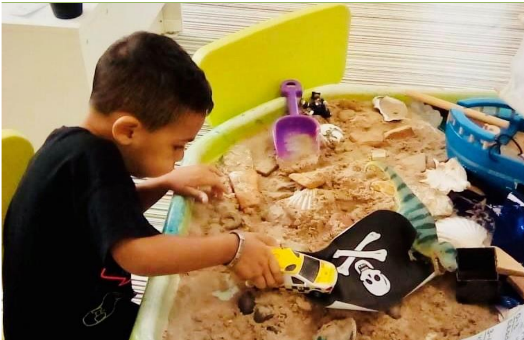
Little Beans Weymouth – October 2023