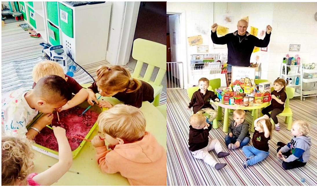
Little Beans Weymouth – October 2023