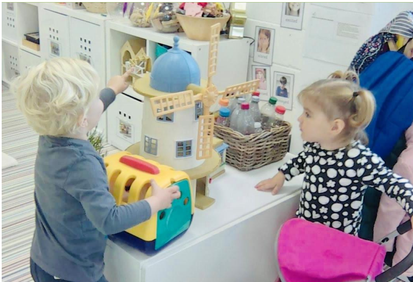
Little Beans Weymouth – September 2023