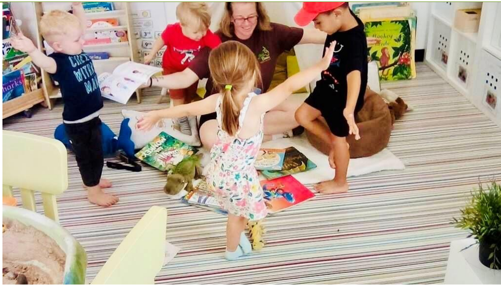
Little Beans Weymouth – September 2023