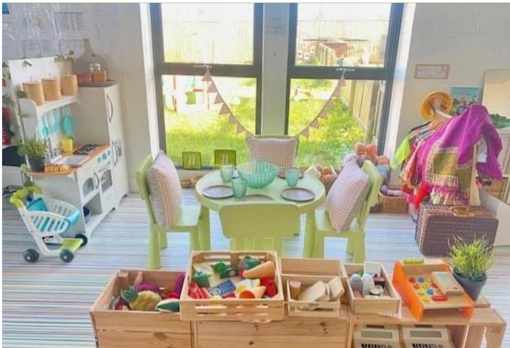
Little Beans Weymouth – August 2023