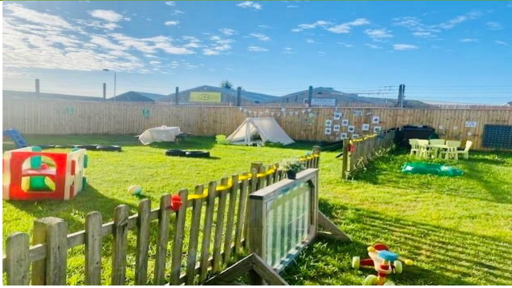
Little Beans Weymouth Garden – August 2023