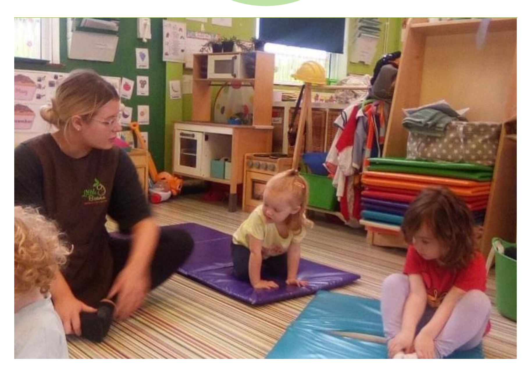
Little Beans Garland - August 2023